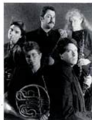
The Arcadian Winds

Including—Sonate for Violin; Divertissement Featuring The Arcadian Winds