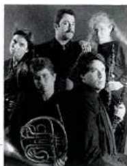
The Arcadian Winds

Including—Sonate for Violin; Divertissement Featuring The Arcadian Winds